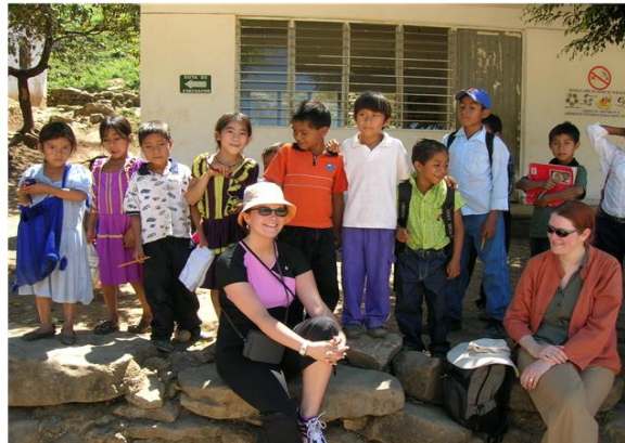
Primate's World Relief and Development Fund: Helping the children of Plan Peredon, Chiapas, Mexico

As individuals and as God's church, we are called to reach out to others. Jesus commanded us to "love your neighbour as yourself" (Matthew 22 v 39). He is our teacher and our model for this command. The Bible says God wants us to share our time, talents and treasure to serve all nations. We in the Cathedral family have been blessed with many gifts. Through our personal commitment and our collective action, we will be strengthened as individual Christians and as a mission-focused church.