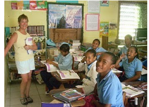
Lending a helping hand in Belize

At Christ Church Cathedral Fredericton, NB