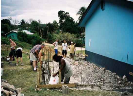
"Blood, sweat and tears" building a foundation at St. Hilda's School, Belize

The Missions Committee invites YOU , our Cathedral family to become involved in loving and helping our neighbours around the world in the name of Jesus Christ.