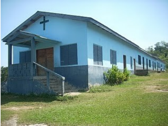
St. Hilda's School, Belize

The Missions Committee invites YOU , our Cathedral family to become involved in loving and helping our neighbours around the world in the name of Jesus Christ.