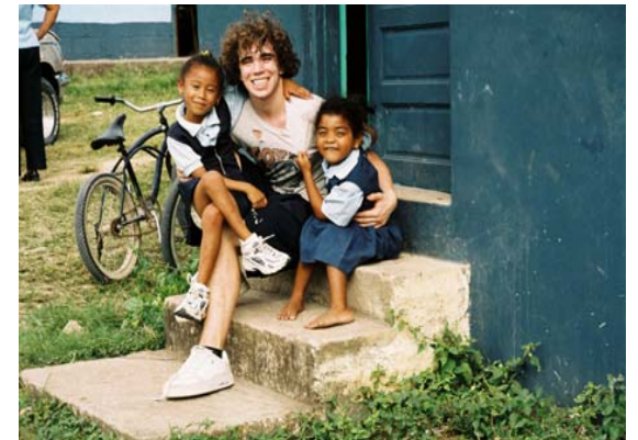
Lending a helping hand in Belize

“Let your light shine before others so that they may see your good works and give glory to your Father in heaven.” (Matthew 5:16)